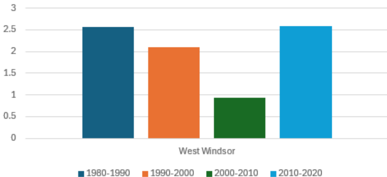
Rate of Change in Housing Stock West Windsor

The rate of change has fluctuated over the past four decades from a low of 0.94 from 2000-2010 to a high of 2.59% from 2010-2020.