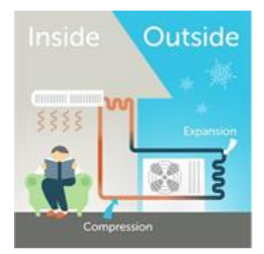
Figure 1: Illustration of how coldclimate heat pumps work.

CONSISTENT WITH THE GOALS : Requires substantial progress toward attainment of the goals established in 24 V.S.A. §4302 and §4352(c)(3), unless the planning body determines that a particular goal is not relevant or attainable. If such a determination is made, the planning body shall identify the